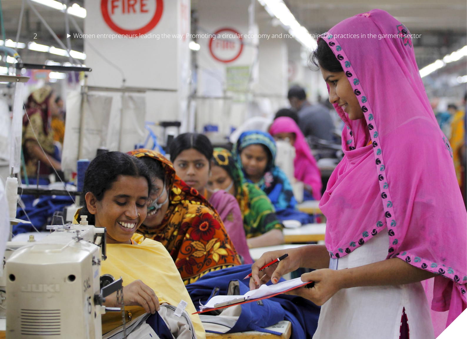
Better Work Programme, Bangladesh. A supervisor interacts with a sewer.

the sector is promoting diverse models, some of which are seldom referenced. The purpose of this research is to shine light on some positive models of women entrepreneurs leading the way on circular economy and gender equality through their businesses.